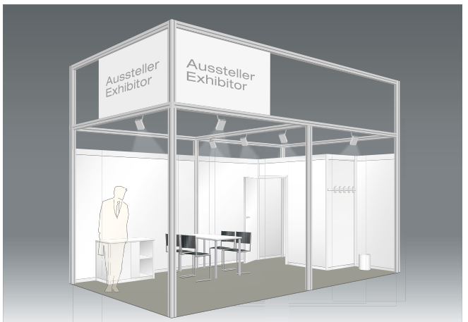
D2 Premium Package, 450.- EUR/m 2 (row stand)